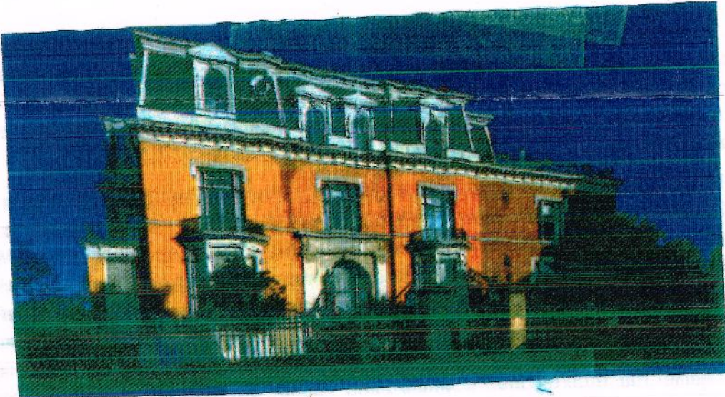
7/20: BUFFALO CLUB: