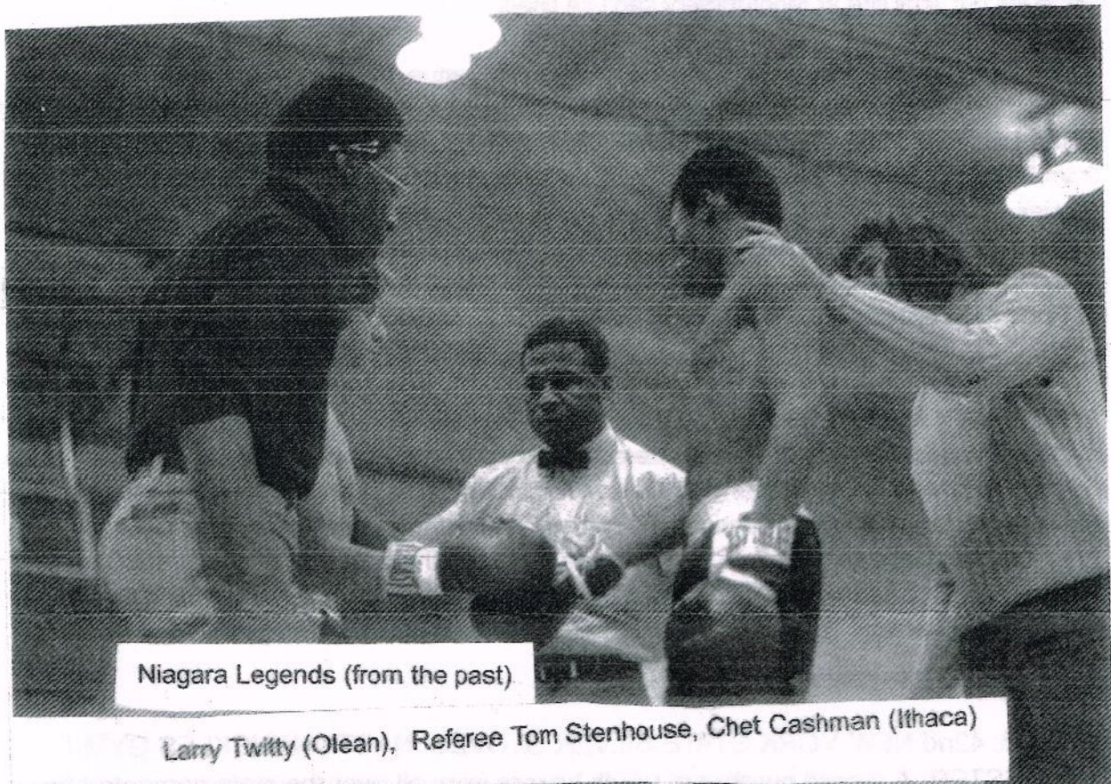
Niagara Legends (from the past)